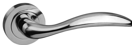
Product Finish Pictured: Polished Chrome